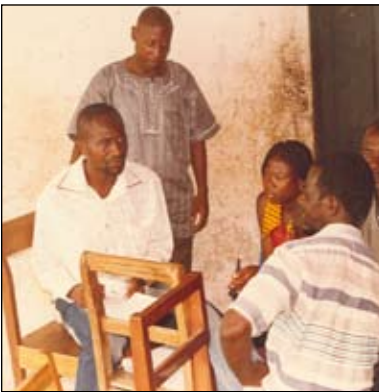
School health coordinator observing a group work session at a workshop for school health teachers and head teachers

3. Invite all interested children to begin discussing these issues in more detail. Gaps in the children’s knowledge about good health, hygiene and sanitation practices revealed by the knowledge assessment should be addressed. This should be done in a fun way that uses active learning methods and increases the children’s interest in participating in the club. For example, organize a discussion under shady trees in and around the school compound. To kick-start the discussion, ask children to look around their school compound and ask: Could it be cleaner? What role do children have in keeping it clean? Such an approach draws out, and builds, the children’s understanding of what constitutes a poor health, hygiene, and sanitation practice. It begins the process of leading children to discover that they are part and parcel of creating a better, cleaner, and more hygienic environment.