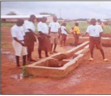
The health walk passes by a soak away