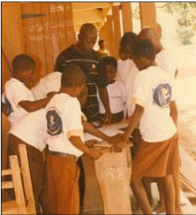
A community school health management committee chairperson in a group work session with club members

CRS/Ghana's monitoring strategy is further guided by the use of action plans. The content of each action plan is tailored to a particular school and community, according to the hygiene, sanitation, and health situation there. Each School Health Club has its own action plan, based on the health issues it has identified. Monitoring visits use the action plan as a basis for assessing the School Health Club's progress toward its goals.