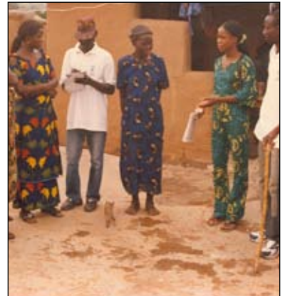
Community school health management committee members on a hygiene promotion visit to a household