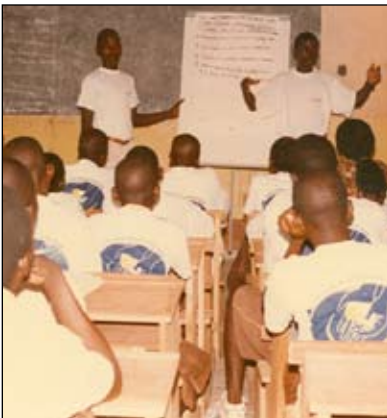
Secretary of School Health Club responding to questions from participants

An important feature of CRS/Ghana’s school health program is that it involves children at each level of implementation. Involving children in programs affecting their lives is critical; it improves effectiveness and ultimately leads to ownership of the program by children and community members, thereby enhancing sustainability. When children are involved, it makes them proud owners of the program, and they happily spread its benefits. 5