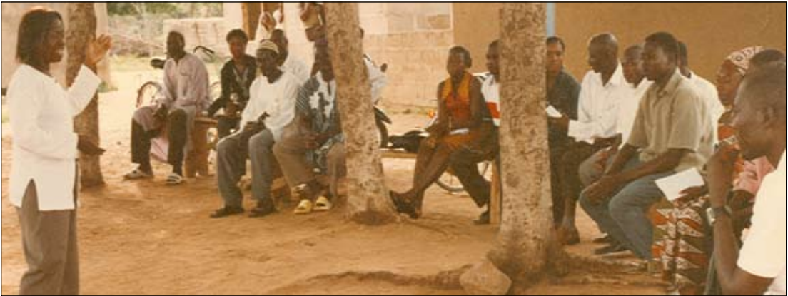
Public health nurse of Ghana Health Service educating teachers and community members on the benefits of de-worming