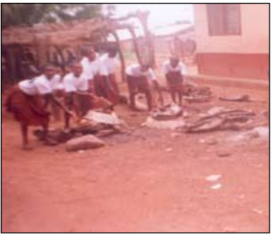
School Health Club members assessing sanitation situation during a health walk