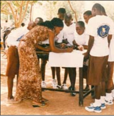
School health teacher assisting club members during a workshop group session