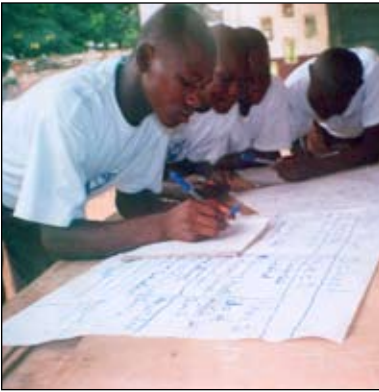
School Health Club members drawing an Action Plan